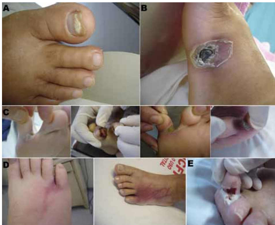
Figure 1. Primary skin lesions in patients with invasive fusariosis in the hematology unit at University Hospital, Federal University of Rio de Janeiro, Rio de Janeiro, Brazil, 2000–2010. A) Onychomycosis; B) ulcer; C) intertrigo; D) intertrigo evolving to lymphangitis before dissemination. (First image in D is the same patient as the first image in C; second image in D is the same patient as the fourth image in C.) E) Necrosis in a lesion of intertrigo (evolution of the lesion shown in the third image in C).

Our results showed that interdigital intertrigo was as common as onychomycosis, occurring in 7 of the 14 cases with a cutaneous portal of entry. Onychomycosis is usually caused by Candida spp. and dermatophytes (12), but fusarial onychomycosis is a known clinical entity (13). Furthermore, recent studies have suggested that nondermatophyte fungi (including Fusarium spp.) are emerging as causes of onychomycosis (14–16). By contrast, interdigital intertrigo is rarely caused by Fusarium spp. (17).