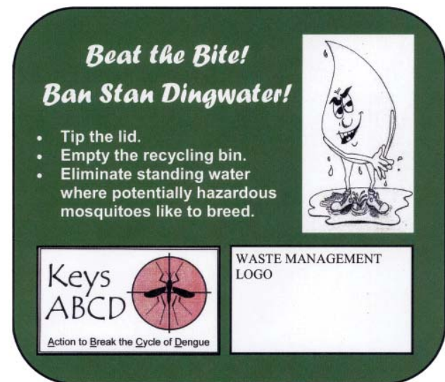
Figure 2. Cartoon character used in public relations campaign to control dengue outbreaks, Florida, USA, 2009–2011.

Second, we recommend that public health agencies involved in responding to an outbreak of dengue