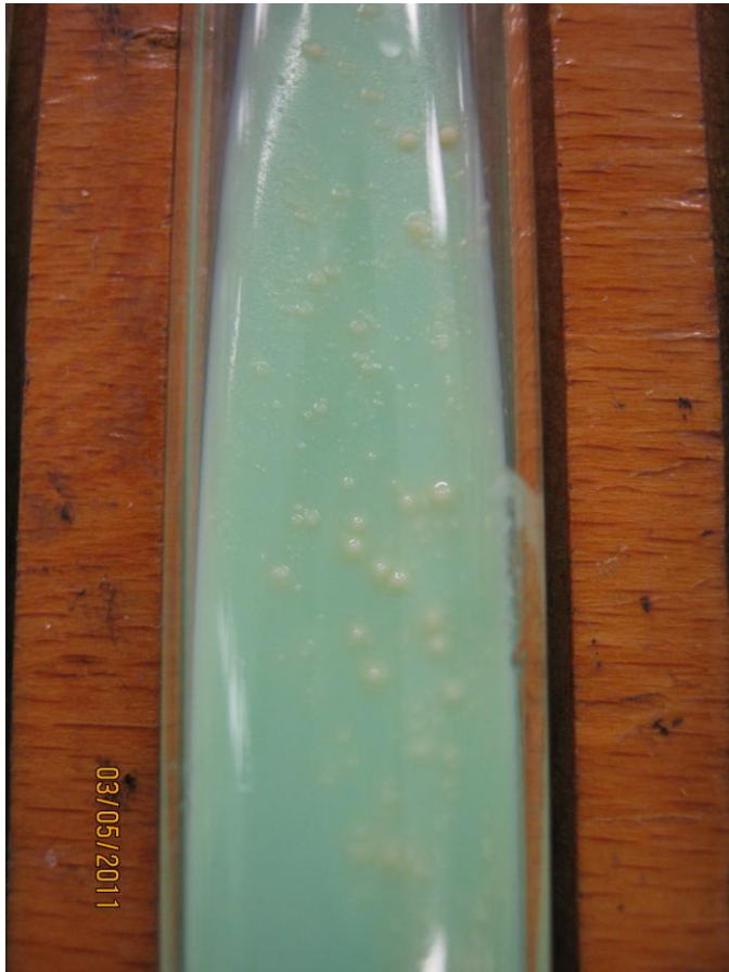
Technical Appendix Figure. Colony morphology of Mycobacterium orygis on Stonebrink medium.