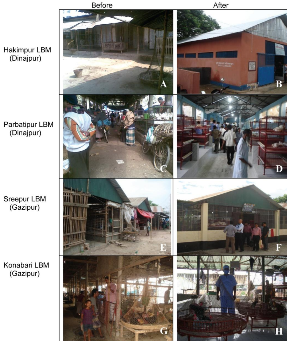
Figure 3. Infrastructure improvements in live bird markets (LBMs) in Dinajpur and Gazipur districts, Bangladesh, 2010. After assessing several LBMs in each district, 2 were selected in Dinajpur (A, C) and 2 in Gazipur (E, G) for our intervention. The renovated Hakimpur (B) and Parbatipur (D) LBMs in Dinajpur, and Sreepur (F) and Konabari LBMs (H) in Gazipur included tiling of poultry stalls and floors; supplying metal cages, pressure sprayer for cleaning and disinfection, improved water supply and drainage, modern slaughter facilities for hygienic processing of poultry meat; and establishing compost and biogas for waste disposal. In all 4 markets, biogas plants are being used for proper disposal of LBM waste and large animal slaughter waste, and the connected generators are being used to run lights and fans on a regular basis because frequent electric failure (load shedding) is common in Bangladesh.