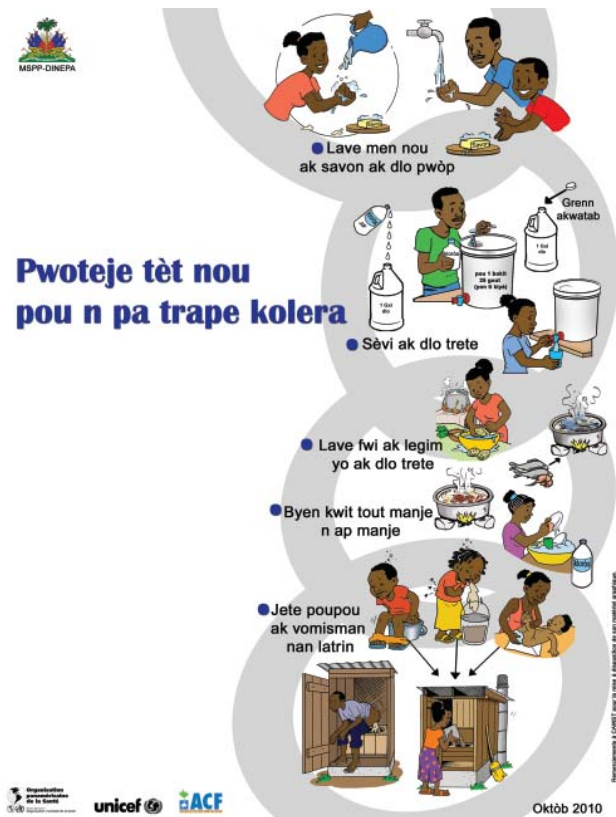
Figure 3. Educational poster (in Haitian Creole) used by the Haitian Ministère de la Santé Publique et de la Population (MSPP) to graphically present the ways of preventing cholera. DINEPA, Direction Nationale de l'Eau Potable et d'Assainissement; UNICEF, United Nations Children's Fund; ACF, Action Contre la Faim.

To increase access to treated water and raise awareness of ways to prevent cholera, a consortium of involved NGOs and agencies, called the water, sanitation, and hygiene cluster, met weekly. Led by Haiti's National Department of Drinking Water and Sanitation and the United Nation's Children's Fund, the members of this cluster targeted all piped water supplies for chlorination and began distributing water purifying tablets for use in homes throughout Haiti. CDC helped the National Department of Drinking Water and Sanitation monitor these early efforts with qualitative and quantitative assessments of knowledge, attitudes,