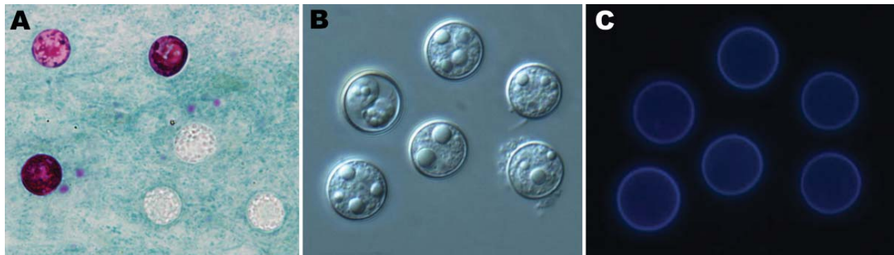
Figure 1. Cyclospora cayetanensis oocysts under light microscopy of stool smears stained with the modified acid-fast stain (A), showing differential interference contrast microscopy of wet mount (B), and results of epifluorescence microscopy using a 330–380 nm ultraviolet excitation filter (C). Two oocysts are stained at different intensities (A), and a partially sporulated oocyst is seen (B). Original magnifications ×1,000.

In addition to differences in study populations, socioeconomic conditions, and cultural habits, local climatic factors may have contributed to the variation in prevalence of cyclosporiasis observed in different studies. In this study, transmission of C. cayetanensis was seasonal; of the 81 cases of cyclosporiasis detected, 95% (95% CI 95% ± 4.7%) occurred during July 1–September 30, the hottest and rainiest months of the year. This result differs from the peak transmission of C. cayetanensis